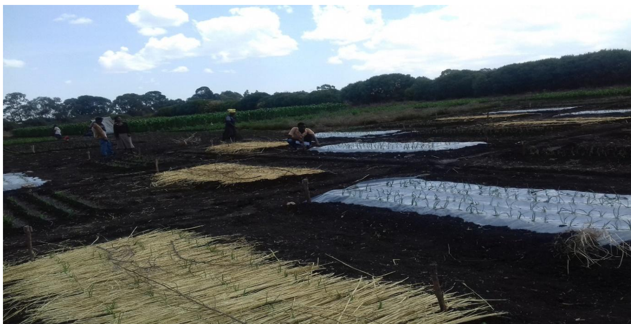
Figure 2. Pictures of No Mulch (NM), Straw Mulch (SM) and Plastic Mulch (PM ) of treatments