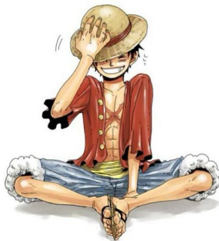
Figure 4. "Straw Hat" monkey D luffy.

Many Teenagers want to be different from others in this time period. For the main characters in the animation, no matter how the modelling or the colors match is, the more outstanding, the better. They are not averse to the role of red hair, blue hair or purple hair. They don't wear the same clothes as others, because the more marked decoration is more representative of the concept of "self". This is especially prominent in Japanese animation, where "Straw Hat" can represent Monkey D Luffy in One Piece (see Figure 4) and "Rasengan" can represent Uzumaki Naruto in Naruto .