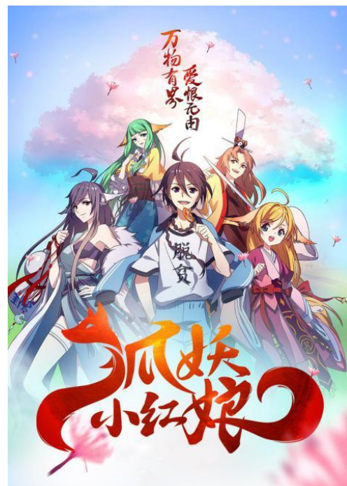
Figure 3. Little fox matchmaker.