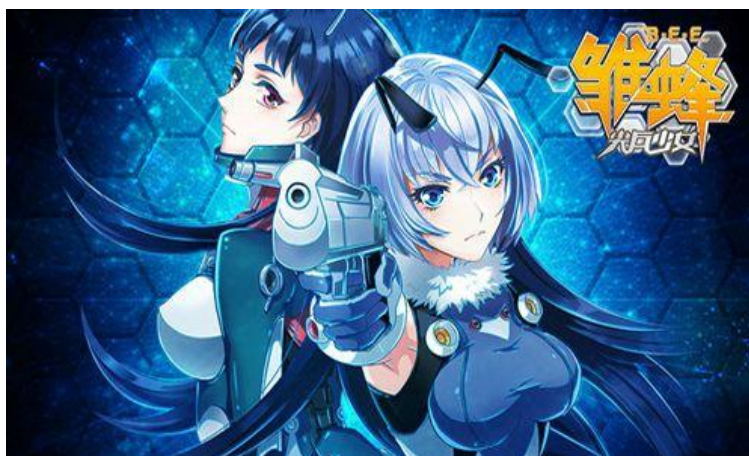
Figure 5. School shock.

It is called that “It is easy to get a thousand soldiers but hard to get a general”. A large number of talents of domestic animation have flowed to Japan and the United States. The reason is the problem of economic development. As China’s economy has grown steadily, more and more talents are pouring into the Chinese animation market. However, it is difficult to get started. And the Chinese people still have the voice that foreign animation is good. There is even denigration of domestic animation. In this case, the domestic animation still has made achievements. They even get some confidence. For example, when School Shock (see Fig.5) of “with sinister appearance” landed in Japan, nobody asked for it. The core problem is the shortage of talents. If there are no people who come out of domestic land, there won’t be a touching story or a moving animation.