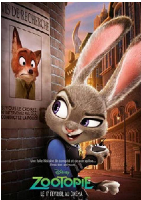
Figure 2. Zootopia.

American animations are mostly produced by Disney and DreamWorks. Compared with Japanese animation, American animation pays more attention to young and old. The first major advantage of American animation is that the amount of money invested is enormous, with Kung Fu Panda investing $130 million, while the Chinese animated film the Lotus Lantern directed by Chang Guangxi is only invested 12 million yuan. Secondly, there are many production teams, which mainly ensure that American animation can produce two to three big-budget productions a year. Third, the production time is long. Disney’s zootopia (see Figure 2) has been modified for five years over and over but never abandoned.