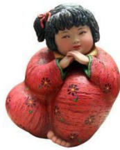
Figure 2. Zhang Colorful.

built buildings of different styles, among which the concession buildings and Five Avenue buildings have been integrated with new cultural elements (Tang Tian & Wang Jiayi, 2020). Today, the traditional folk art culture in Tianjin is mainly represented by the colorful works of Tianjin clay figures (see Figure 2), and Yangliuqing fat doll modeling of Yangliuqing (see Figure 3). These are the most representative forms, featuring round figures, lovely faces, and lively forms that consistently convey the hospitality, humor, and contentment of the Tianjin people. Therefore, the guide system can adapt to the unique geographical environment, history, and culture of Tianjin. It can extract new visual elements from traditional folk art to new inspirations, combining simple modeling and unique color elements in its design. This design not only intuitively reflects the regional characteristics of Tianjin but also aligns with people's psychology and spirit. The guide system always exudes a certain attraction, allowing people to sense the history, culture, and modernity of Tianjin simultaneously. This fosters a desire to delve deeper into understanding the city and ultimately fall in love with it.