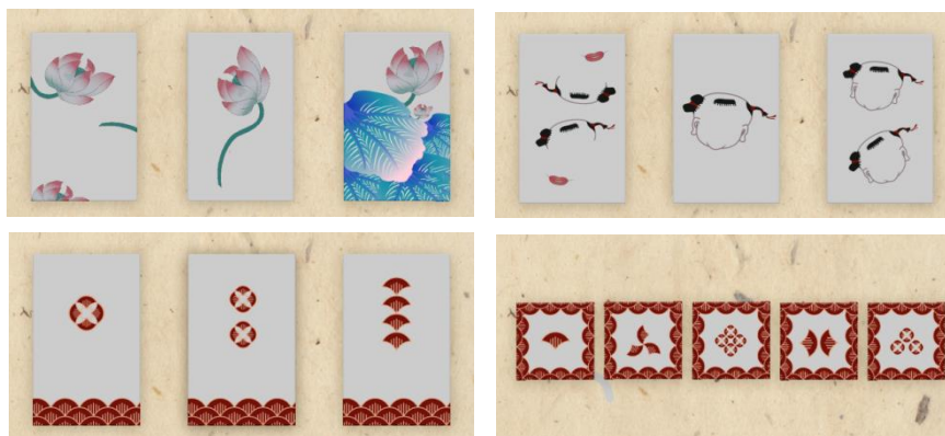
Figure 4. Element extraction of Yangliuqing New Year Pictures (painted by the author himself).

In Tianjin willow town, for example, willow pictures are the crown of the four Chinese New Year pictures, "lotus in more", "auspicious", "gold", "longevity three", one of the most deeply popular or the lotus in the image of the fat baby fish, now its image element extraction (see Figure 4), in order to apply to the guide system.