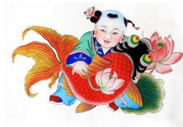
Figure 3. Yangliuqing New Year Picture.