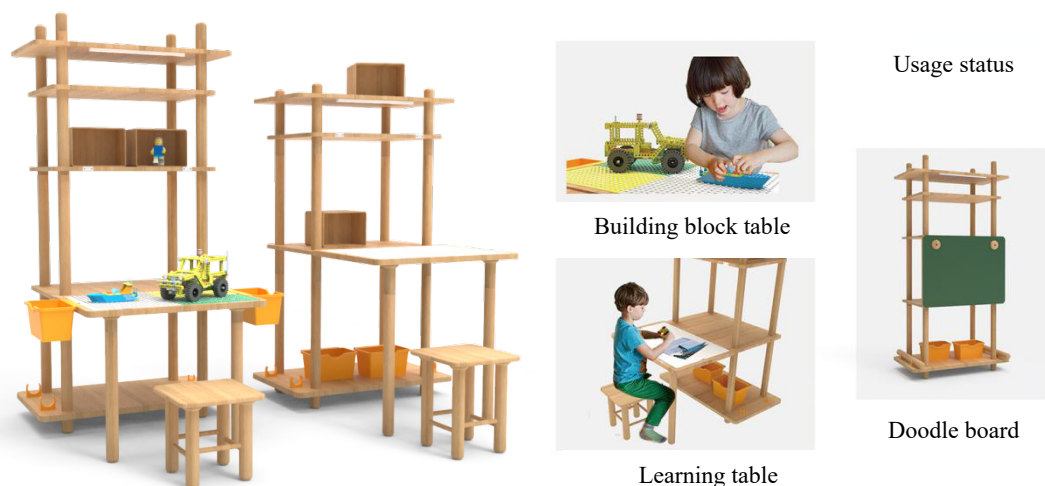
Figure 3. Design scheme of children's growth-oriented furniture.

life cycle of children's furniture, which is feasible and practical.